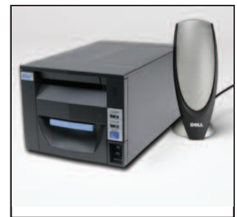
User Communication Tool