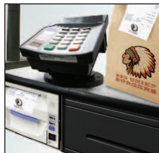
For Limited Counter Space