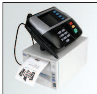
Space Enabling Design